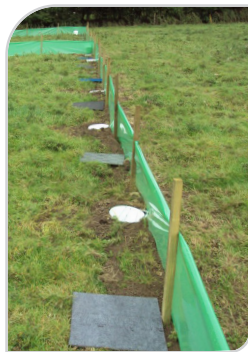
Optional Pitfall Trap & Refuge Tiles Available