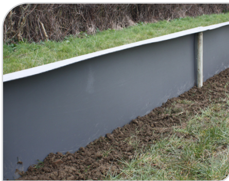
Roll of Black Semi-Permanent Heavy Duty Newt Fence

The Permanent Newt Panels are also non-toxic and chew-resistant, ensuring durability against wildlife interactions. Additionally, it is designed to resist thermal expansion, reducing the risk of distortion in hot weather conditions.